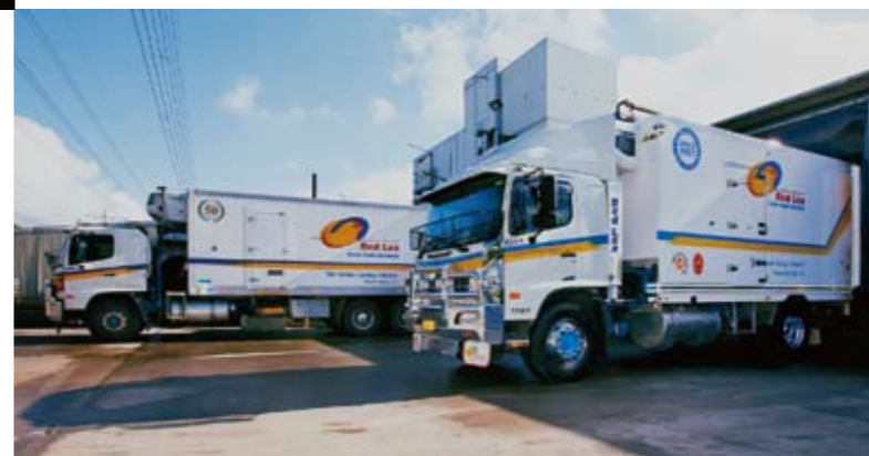
Red Lea Chickens (RLC) transport chicken daily to its 41 retail outlets in NSW

Red Lea Chickens operates 41 retail stores in New South Wales. The company has been operating HINO trucks since 1980 and currently runs 29 HINO trucks for delivery. The mechanics at Red Lea Chickens are also all praise for HINO genuine parts, "We once used a brake lining which is not a HINO genuine parts, but it made a terrible braking noise, and we had to replace it