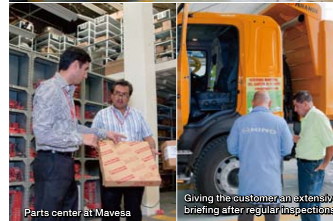
Parts center at Mavesa