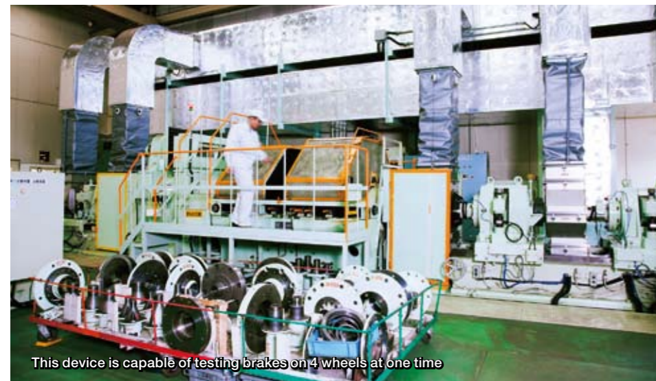
This device is capable of testing brakes on 4 wheels at one time