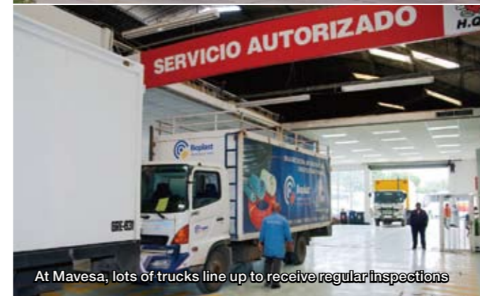
At Mavesa, lots of trucks line up to receive regular inspections