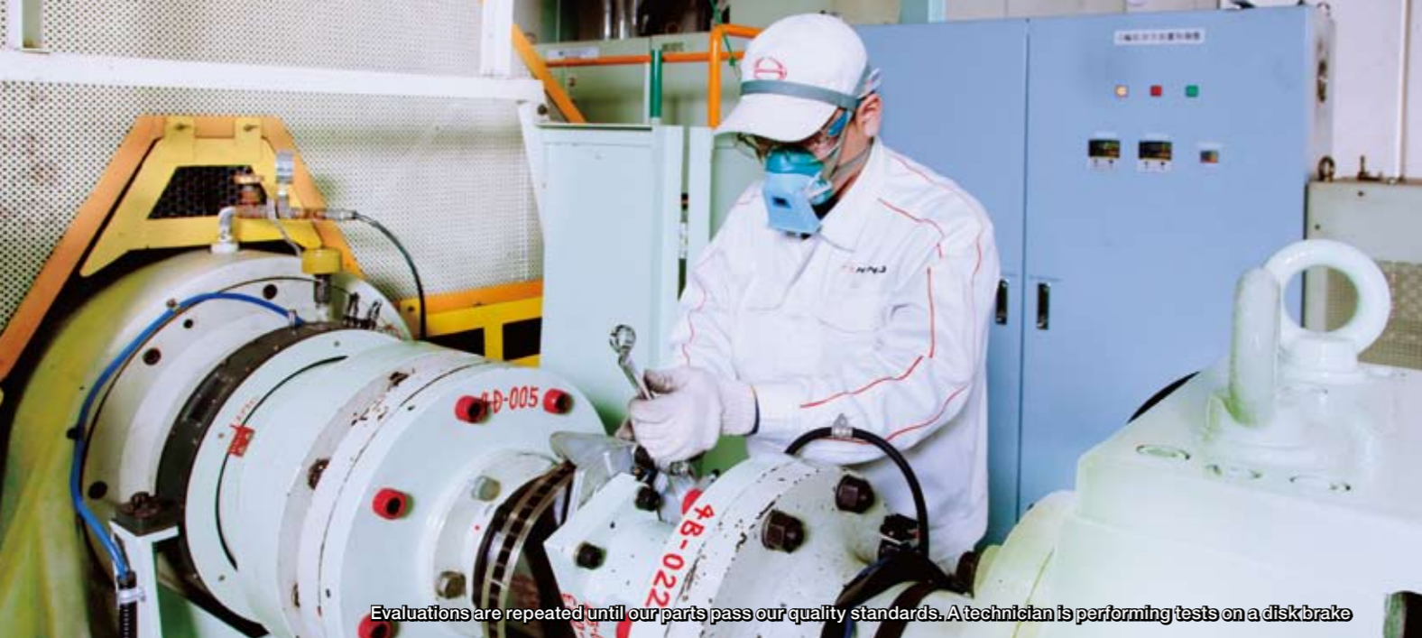
Evaluations are repeated until our parts pass our quality standards. A technician is performing tests on a disk brake

earlier than the HINO genuine lining. There really is that much difference in quality between genuine and non-genuine parts. That's why we no longer use non-genuine parts." Just as this example shows, any HINO owner who has ever used a non-genuine part in the past should know by experience the clear difference between genuine and non-genuine parts.