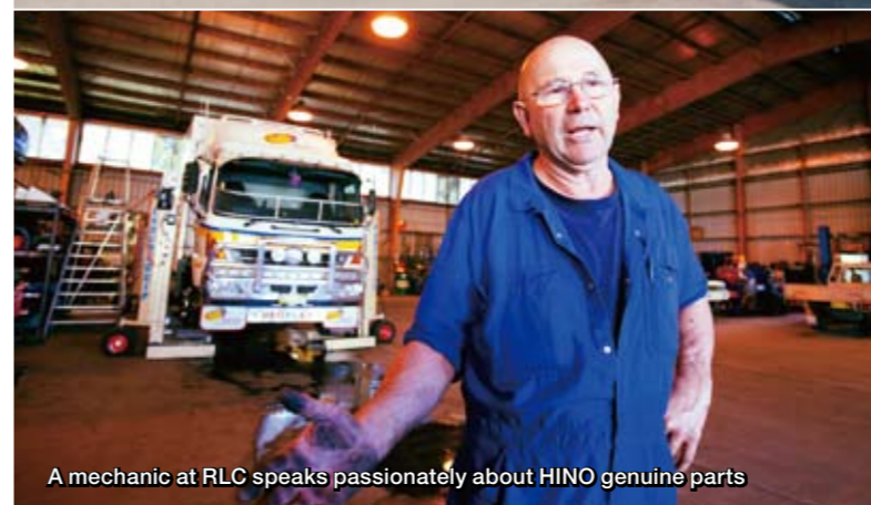
A mechanic at RLC speaks passionately about HINO genuine parts