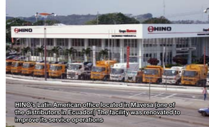
HINO's Latin American office located in Mavesa (one of the distributors in Ecuador.) The facility was renovated to improve its service operations