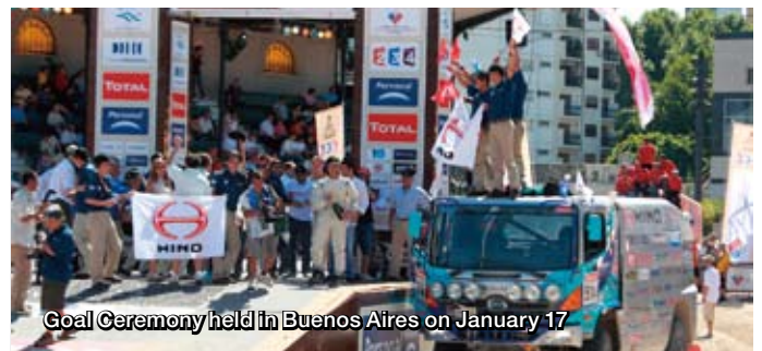
Goal Ceremony held in Buenos Aires on January 17