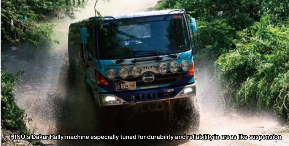
HINO's Dakar Rally machine especially tuned for durability and reliability in areas like suspension