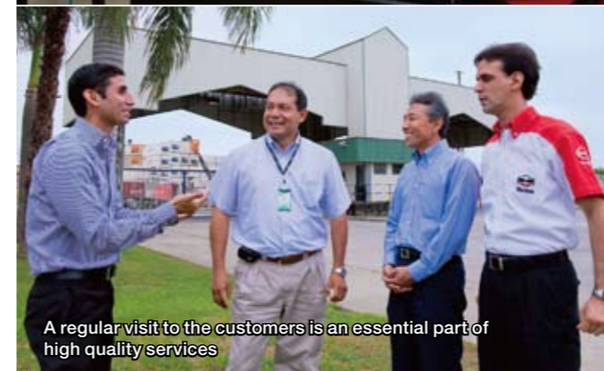
A regular visit to the customers is an essential part of high quality services

In addition to inspections that we provide for free of charge at 1,000km and 5,000km, we also recommend regular maintenance services every 5,000km. We believe following through with these recommendations helps our customers prevent breakdowns before they occur. So it's not such a surprise that a HINO truck that has been inspected regularly and cared for through appropriate maintenance services has been on the road for 1 million kilometers without engine overhaul. I believe there are many more HINO trucks like that around the world."