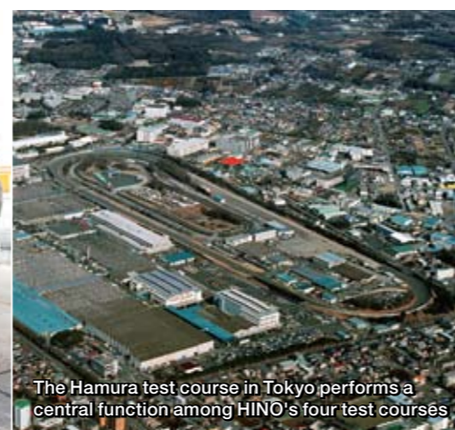
The Hamura test course in Tokyo performs a central function among HINO’s four test courses

range of situations depending on countries where they are used. Testing and evaluations will be conducted taking such factors into account. Mr. Iwamoto adds, “First, we conduct studies at each locale to which HINO products will be exported. ‘How will the customers be using our products? And under what kind of condition? What are the road conditions? What will their day to day mileage levels be? What will they be transporting?’ The specification of the same model of products may change depending on such conditions. So we go out to where our products will be operating, develop testing programs that will reproduce conditions found in that particular locale, and carry out tests over and over again.” We’ve been told that the item of the tests prepared to be conducted for HINO trucks will be more than 1,000. Mr. Yasuo Abe, Deputy General Manager,