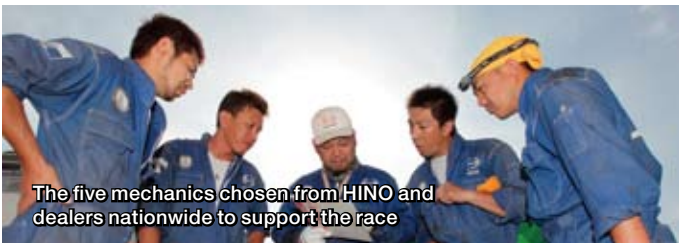
The five mechanics chosen from HINO and dealers nationwide to support the race

There is a lot of news around the world that tells us much about HINO.