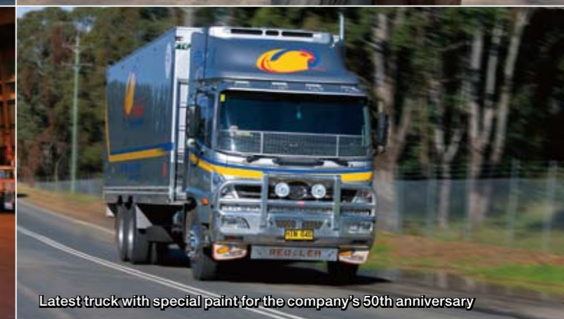
Latest truck with special paint for the company's 50th anniversary