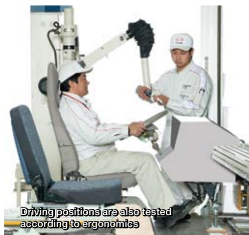
Driving positions are also tested according to ergonomics