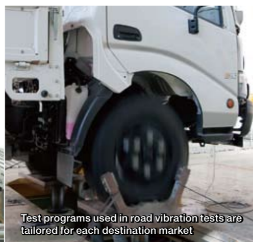
Test programs used in road vibration tests are tailored for each destination market