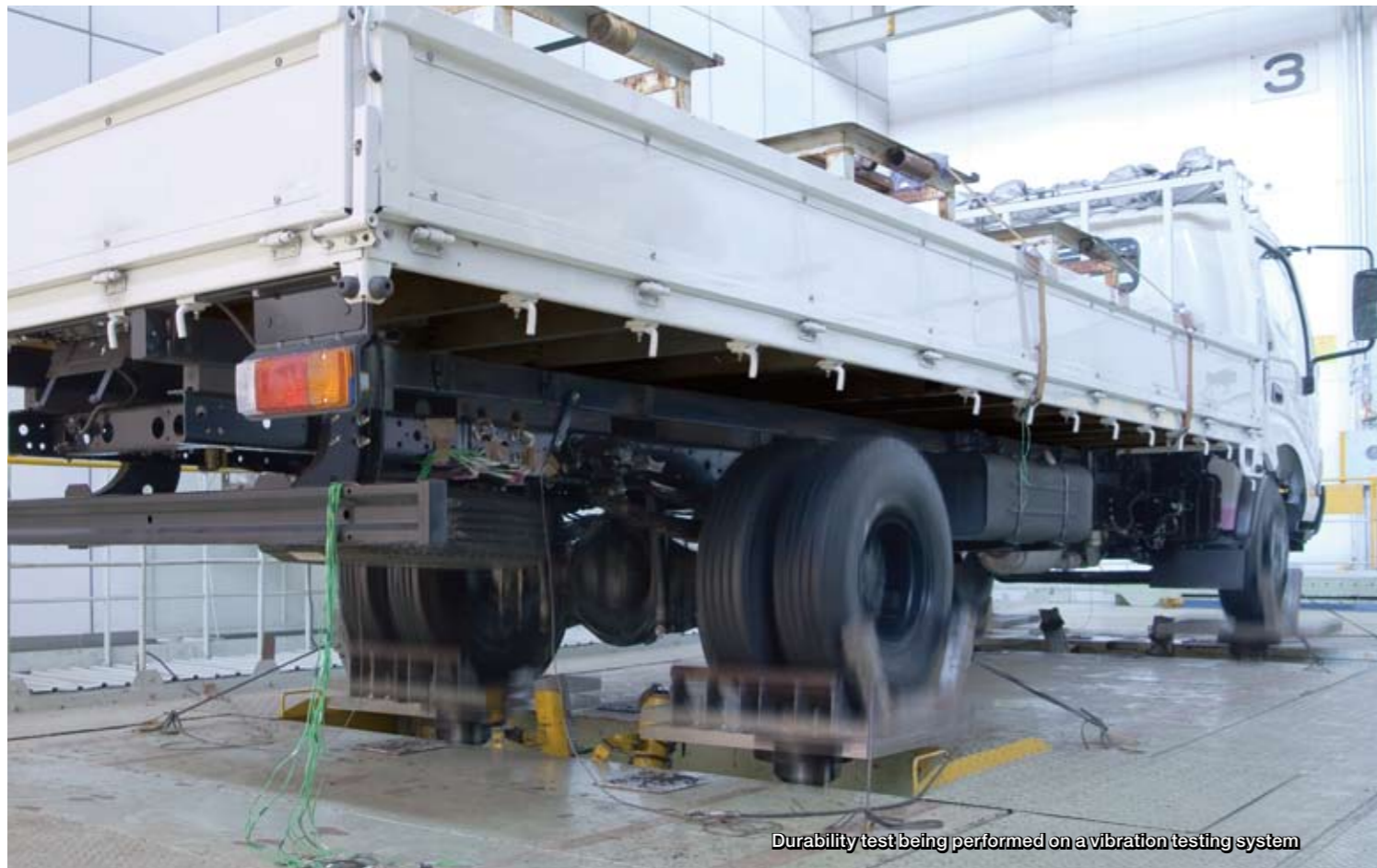
Durability test being performed on a vibration testing system

No matter how high the performance level of a particular product is, no one will want to use it if it breaks down within a short period of time. We believe “Good products” will be the products that have reliability that satisfies our customer. There is a department within HINO whose essential purpose is to verify that customers will be able to use HINO products at their expected potential for as long as possible, and that the products are designed aiming to satisfy our customer. This division is the Vehicle Evaluation & Engineering Div.