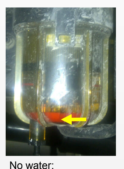
Excessive accumulation: Water accumulation: